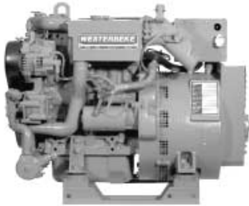
8 BTDA Diesel Generator